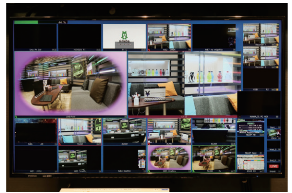
Multi-view screen in front of KAIROS control panel