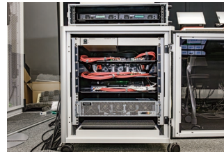
▲ Kairos Core 1000 AT-KC1000T mainframe securely housed in a silent rack.