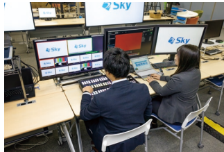
▲ Control panel and Kairos Creator for video compositing and editing.