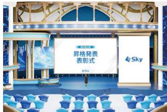
▲ Live-streamed video of in-house awards ceremony featuring CG-composited presenters.