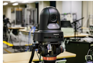
▲ PTZ cameras with presets for efficient shooting.