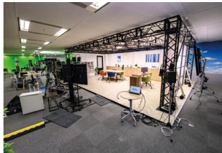
▲ Realistic sets constructed without relying on virtual systems.