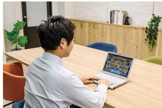
▲ Some 3,800 employees watched the live stream from home.