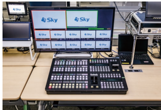
▲ Dedicated control panel for managing broadcast video switching.