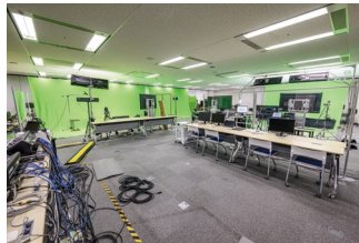
▲ Studio equipped with green screens of various sizes.